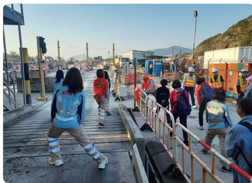
Site office safety training

issues such as adverse weather, landslide or flooding, infectious disease, and heat stroke. Such plans are subject for review regularly to address any significant updates which require additional procedures to ensure occupational safety when facing emergency situation.