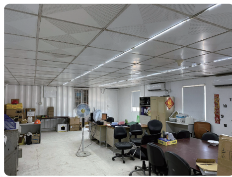
LED light at site office