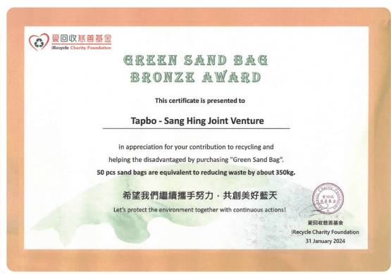
iRecycle Charity Foundation Green Sand Bag Bronze Award

The Group's efforts have been recognised by awards and recognitions. The Group has managed to obtain the Bronze Award in the iRecycle Charity Foundation Green Sand Bag and Merit Award in the 29th Considerate Contractors Site Award Scheme (Public Works - New Works) during the Reporting Period.